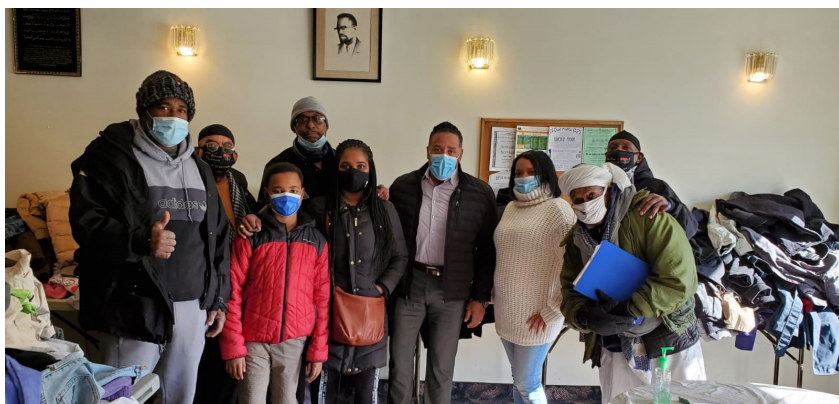
Coat Distribution, Jan. 2021 at Masjid Salahuddin, (Jersey Cares, One Warm Coat)